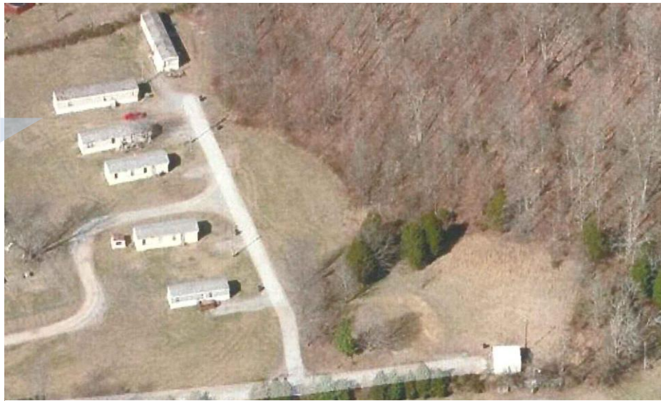
5.32 Acres with (6) Unit Mobile Homes and 1.56 Acre Tract (SELLING SEPARATE)